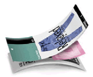
An RF-EAS security tag, sandwiched between the branding and tracking components, is invisible to the customer.